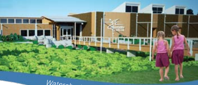
Watershed Center at Valley Water Mill Park